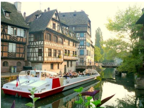
Strasbourg "Bateau mouche"

A four-week program in the capital of Europe Come increase your knowledge in European Business and Politics Improve, or learn, some real French in France